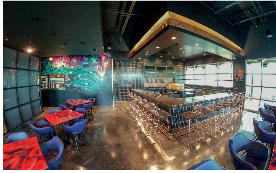
"Oh wow!" (Mellow Mushroom after remodel)

In addition to large projects they still