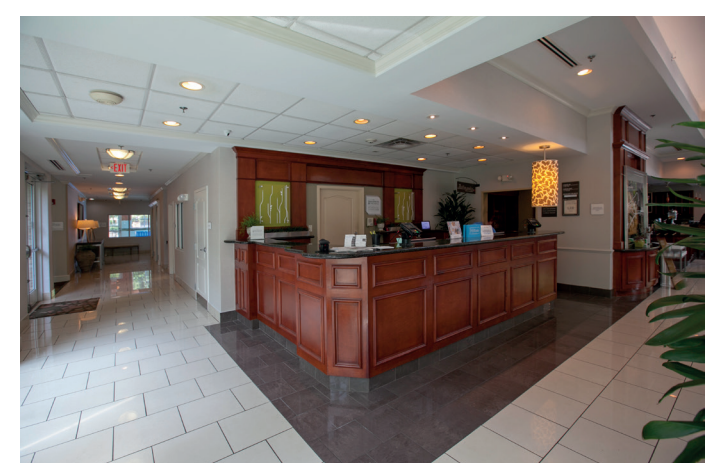
Before picture of a Hotel Lobby