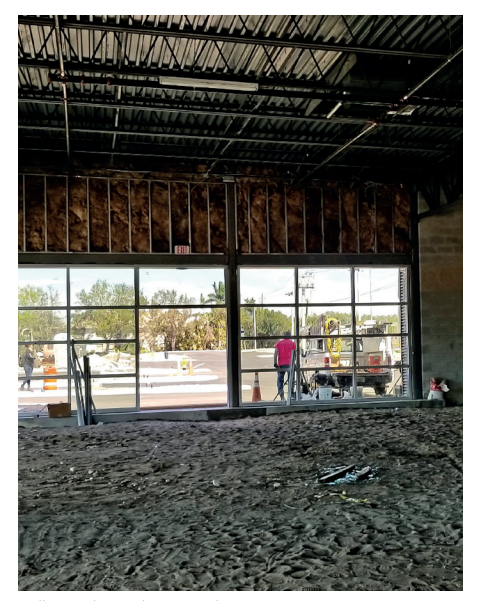
Mellow Mushroom during tear-down.

put up two a day, as opposed to one every two days.