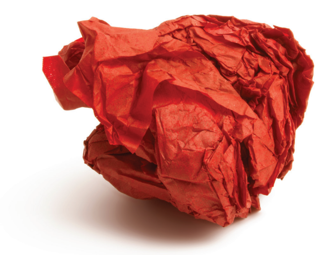
(your supply chain)