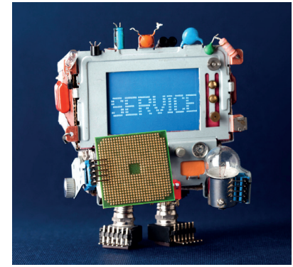
Can robots really connect with customers?

counter is something like a delayed delivery. The computer might tell us what has happened; a shipment has been delayed and will not arrive on time- but it might not tell you why the shipment is delayed. Perhaps is was a simple data entry error, a weather or construction delay, mechanical problems, or something more serious like an accident. At this point we need to look up from the computer and reach for the phone. If you cannot determine the reason why something has happened, it is going to be difficult to provide solutions to your customer. A quality 3PL will have a staff trained on dealing with issues that require a proactive