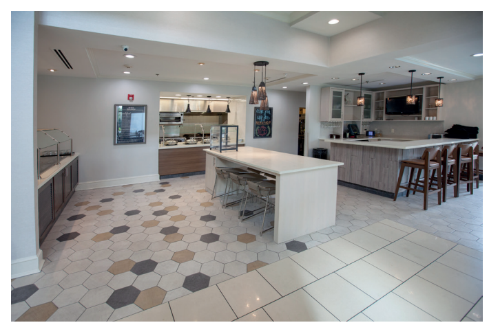
Lobby has been transformed into a cafe.